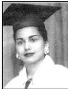
Maria Teresa Mirabal

images courtesy of www.el-bohio.com , c. The Hermanas Mirabal Museum